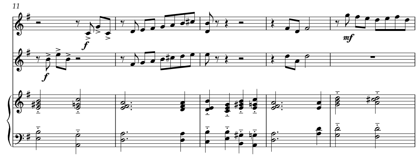
\hfill \mbox{$\odot$} Copyright 2009 by Fabrik Musical Publications, Member ASCAP. Lagny-sur-Marne, FRANCE