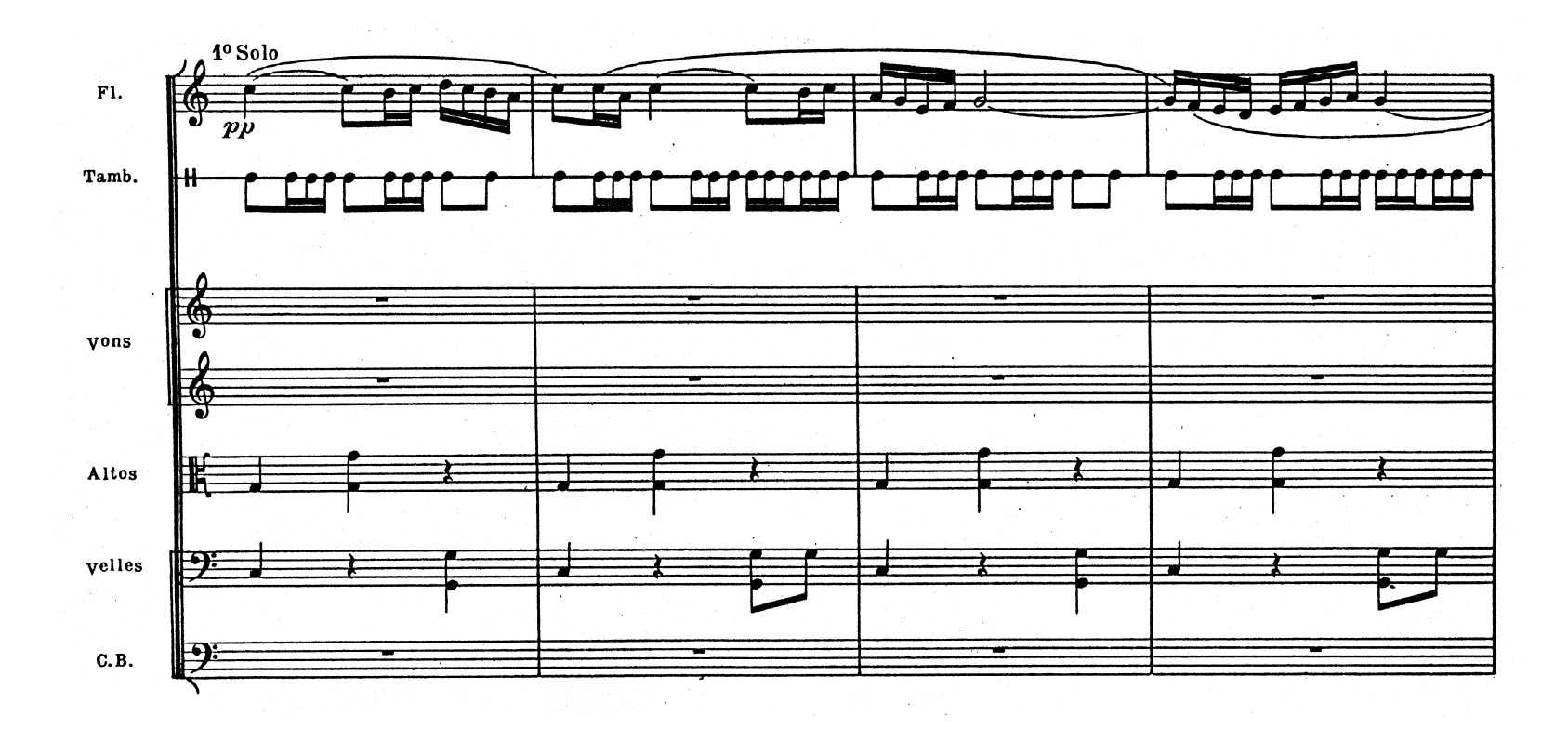
EDWIN F. KALMUS & CO., INC.